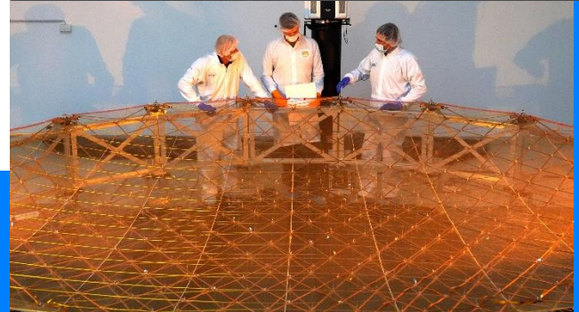
5 m large deployable reflector surface with HPtexas-USM-mesh under RF testing at Airbus Germany